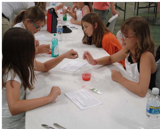
The career day camp allowed participants to experiment with foam, fizz and slime.