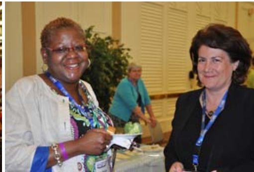
There was plenty of time to exchange ideas at the conference dinners and receptions.