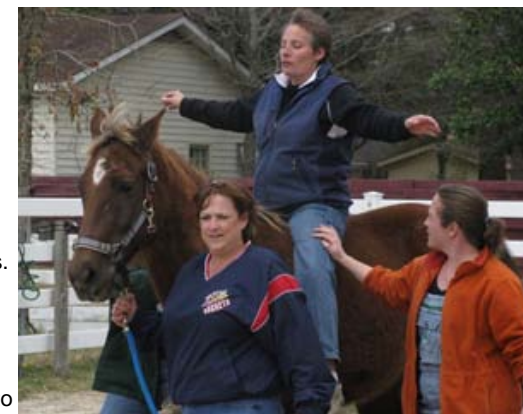
Equine Assisted Psychotherapy is a type of brief therapy.