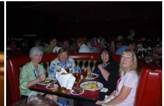
Friends and associates gather at the award ceremony.