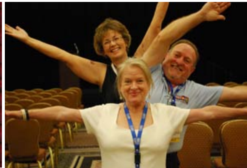
Lots of official business was conducted in Las Vegas, but there was time for fun, too.