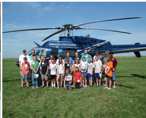
The Nebraska State Patrol helicopter added realism to a mock disaster.

A simulated 911 rescue involved a boy who had fallen from a tree.