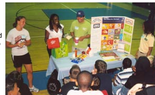
About 250 students participated at a middle school health expo.