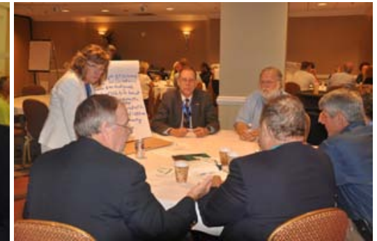
Participants gathered at one of the many workshops offered as part of the NAO Conference.