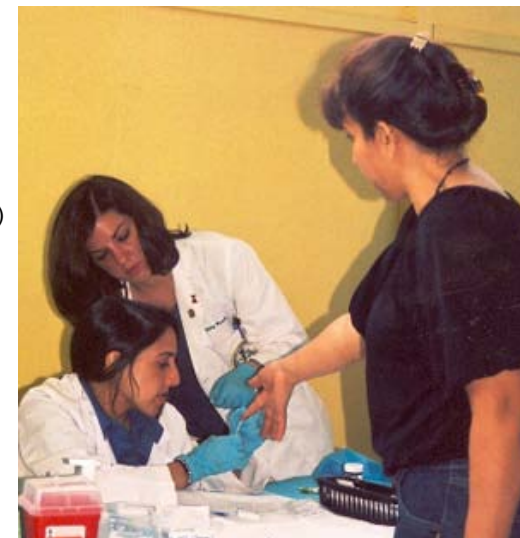
USF health students help out at a community health fair in Tampa.

A student performs a cheek swab for the National Marrow Donor program's Give Life Day.