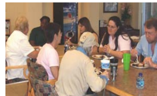
The annual Hope Lodge picnic for cancer patients was a success.