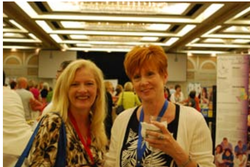
The dinner and reception included time to converse and to see the many displays.