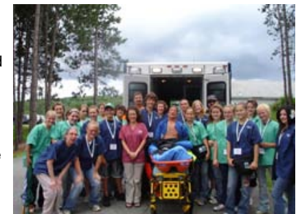
The SEARCH Program puts students in meaningful healthcare settings.

Lowcountry AHEC would like to extend a special thanks to the staff at Beaufort-Jasper-Hampton Comprehensive Health Services, Inc., SC DHEC Region 8, SC Office of Primary Care, SC Office of Rural Health, and the health professions students for making the first pilot program a SUCCESS!! We look forward to future collaboration and the expansion of this model to all South Carolina AHEC regions next year. For more information on the Lowcountry AHEC SEARCH initiative, call 843-782-5052. ">