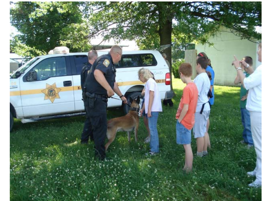
County deputies explained the K-9 program.

A simulated 911 rescue involved a boy who had fallen from a tree.